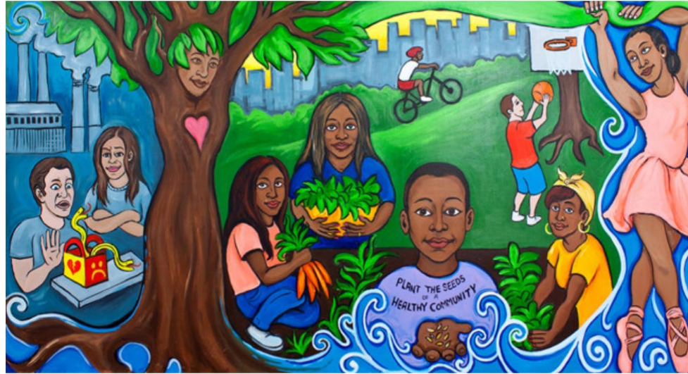
“Visioning a Health Community” Teen led collaborative Montefiore, Bronx NY